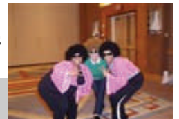
Surprise performers get ready for the Motown Revue and sing along.

At the end of the day, survivors celebrated life by singing and dancing to an all-star staff Motown Revue complete with wigs, microphones, and 60’s tunes. They also received a copy of “My Living and Loving Journey”, a survivorship plan to assist them in documenting their cancer treatment and post cancer needs. Everyone left the scenic Eastern Shore informed, equipped, and empowered to make changes needed to maintain optimal health and wellness. A grant from Sanofi Aventis USA, along with generous contributions from BioScrip Pharmacy and the Marlene and Stewart Greenebaum Cancer Center, assisted in making the Day Away event a tremendous success!