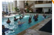
Survivors enjoy water aerobics!

“Let’s Focus On Surviving: The Role of Genetics, Exercise and Nutrition in Survivorship” was the theme for this year’s Day Away event sponsored by the Baltimore City Cancer Program. Day Away is a day long educational retreat that offers breast cancer survivors an opportunity to get away from the repressed stress that comes with cancer treatment and survivorship. One of the top needs revealed in a needs assessment conducted by the program, revealed that cancer survivors are concerned about long term survivorship. Subsequently, the focus of this year’s Day Away was on ways for breast cancer survivors to reduce the recurrence of cancer.